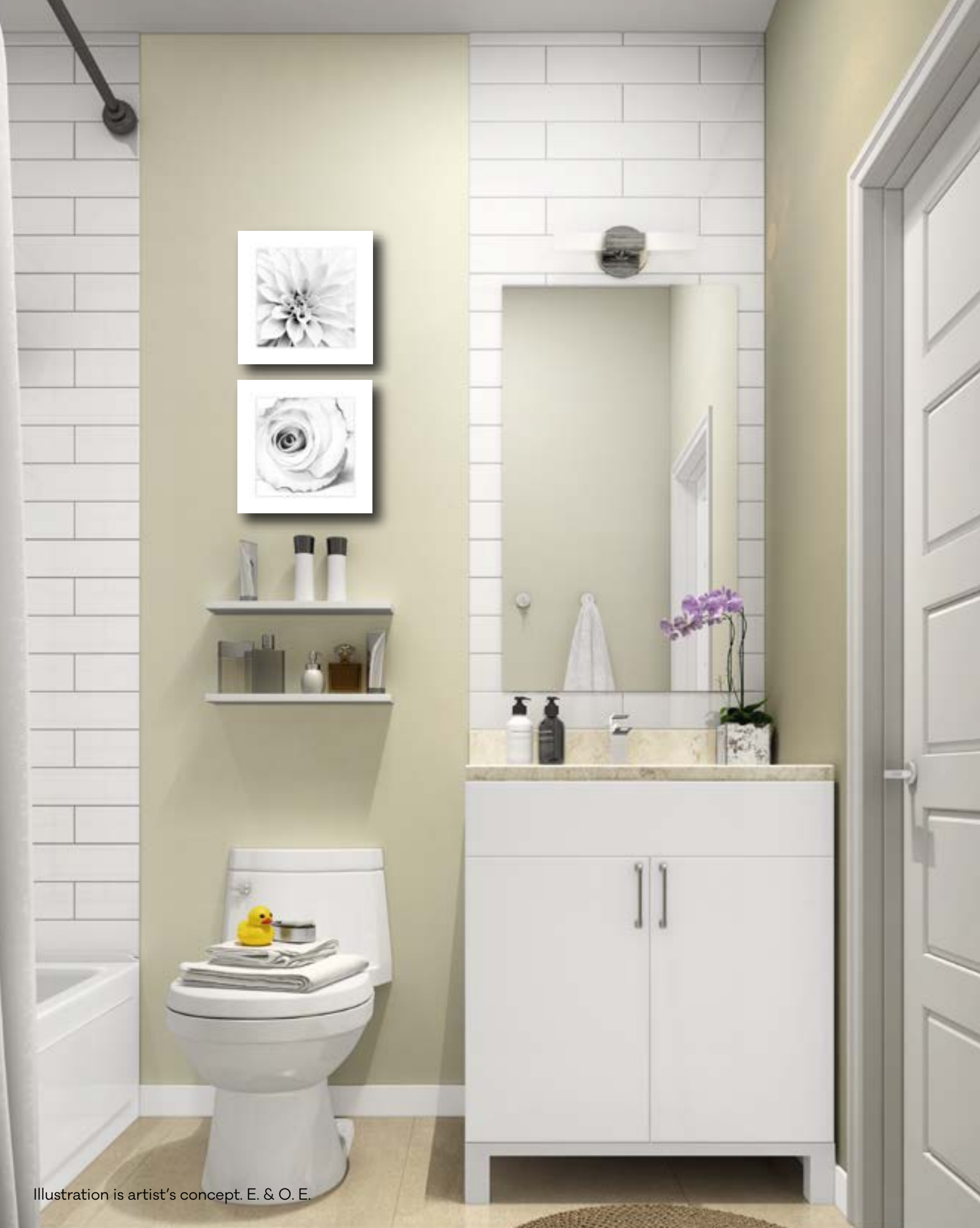
Illustration is artist's concept. E. & O. E.