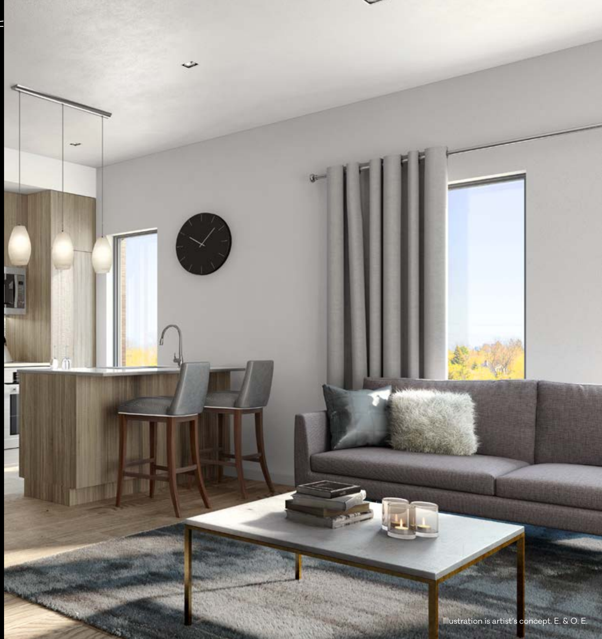
Illustration is artist's concept. E. & O. E.

Open concept living and dining areas make me an ideal space for entertaining family and friends. My one and two-storey models fit your lifestyle, whether you need a little space or a lot.