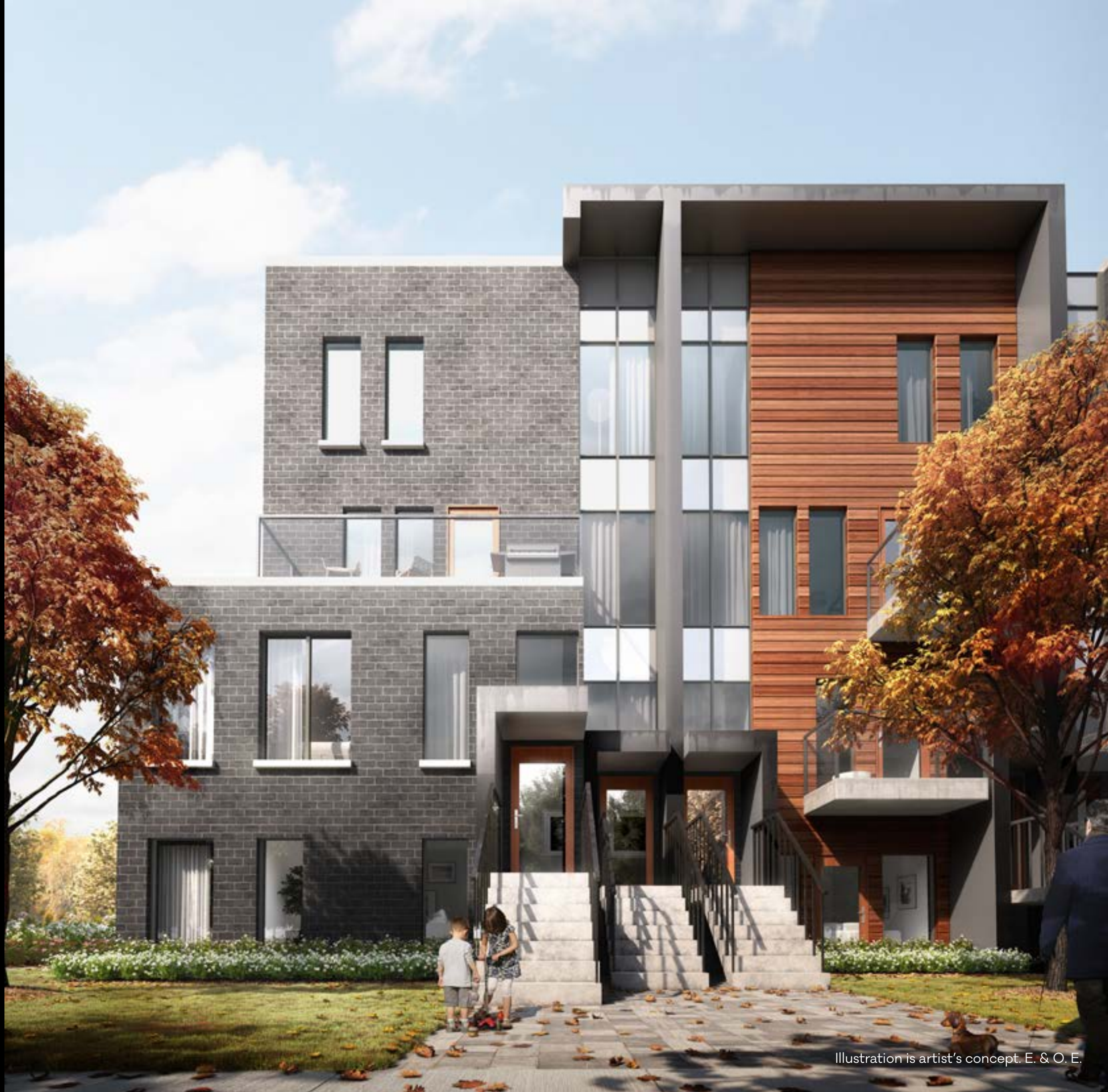
Illustration is artist's concept. E. & O. E.