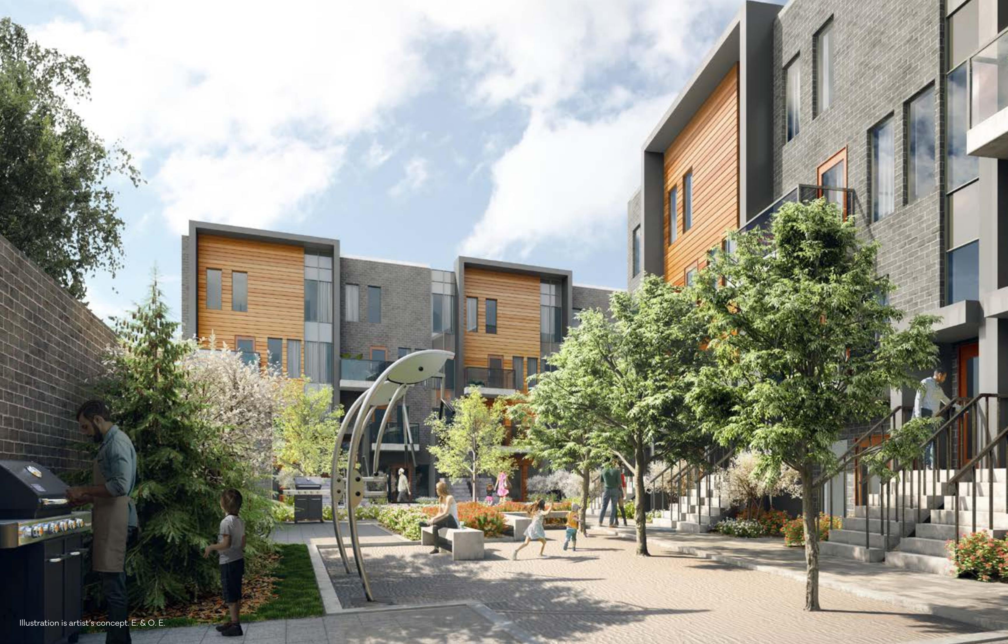
Illustration is artist's concept. E. & O. E.